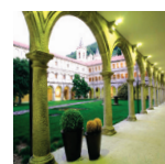
Parador de Santo Estevo ★★★★