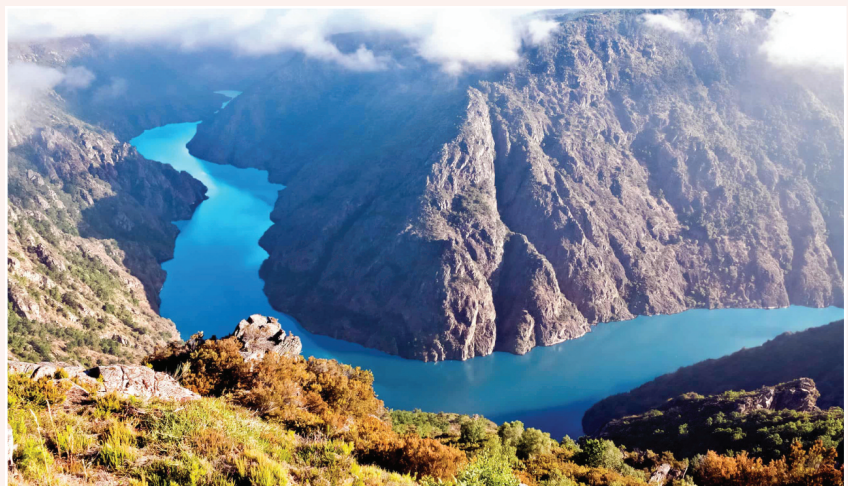
The Ribeira Sacra (Sacred River), its escarpments home to 18 monasteries.