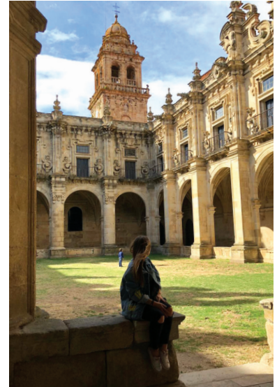
10C Benedictine monastery of San Salvador de Celanova.