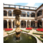
Vila Galé Collection Braga ★★★★