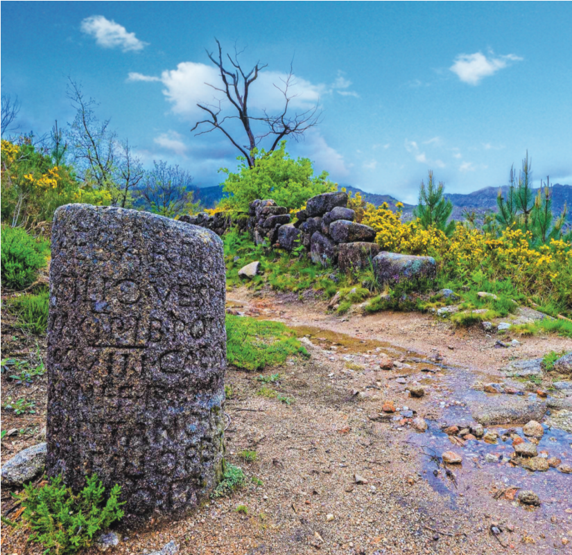
One of 250 remaining Roman milestones along the Via Nova