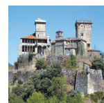
Parador Castillo de Monterrei ★★★★