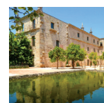
Pousada Mosteiro de Amares ★★★★