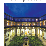
Parador Hostal dos Reis Católicos ★★★★★

outstanding Romanesque Abbey of Oseira... then continue by road (40 mins) to Pico Sacro, from where we walk to Santiago de Compostela.