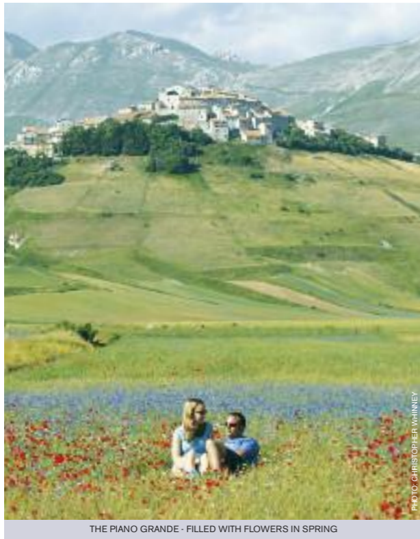
THE PIANO GRANDE - FILLED WITH FLOWERS IN SPRING

Route Open • 1st May to 18th Jun; 27th Aug to 16th Oct