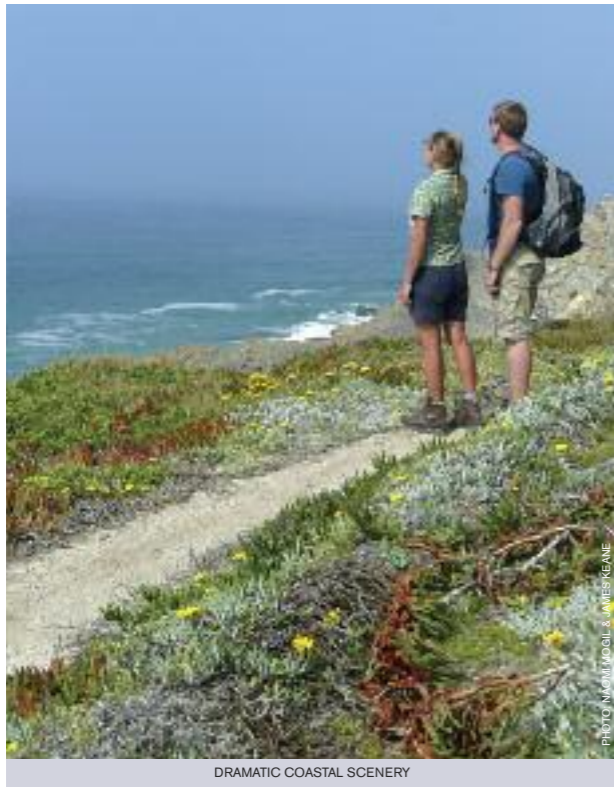
DRAMATIC COASTAL SCENERY

Route Open • 16th Apr to 30th Jun; 27th Aug to 31st Oct