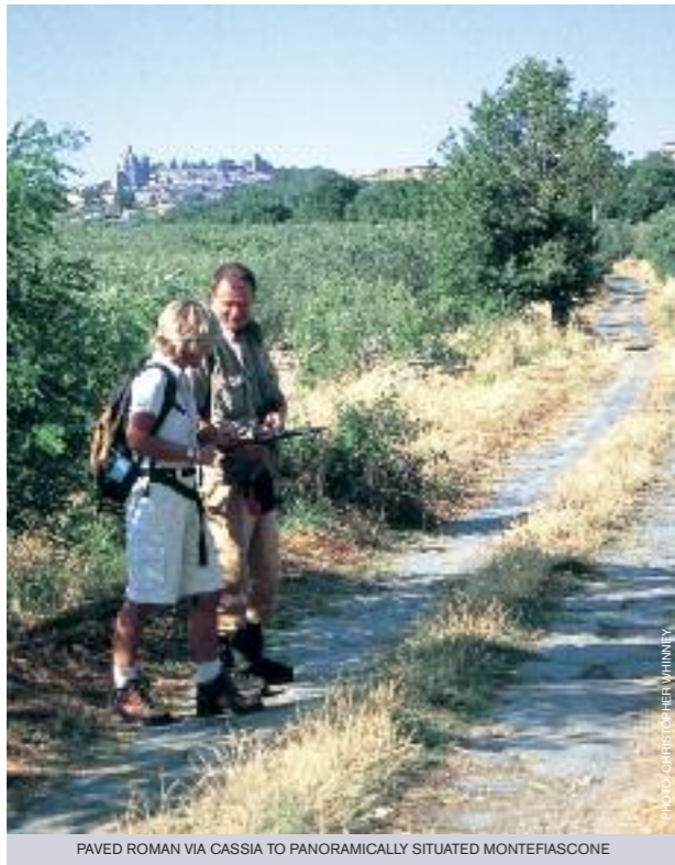
PAVED ROMAN VIA CASSIA TO PANORAMICALLY SITUATED MONTEFIASCONE

Route Open • 16th Apr to 30th Jun; 27th Aug to 16th Oct