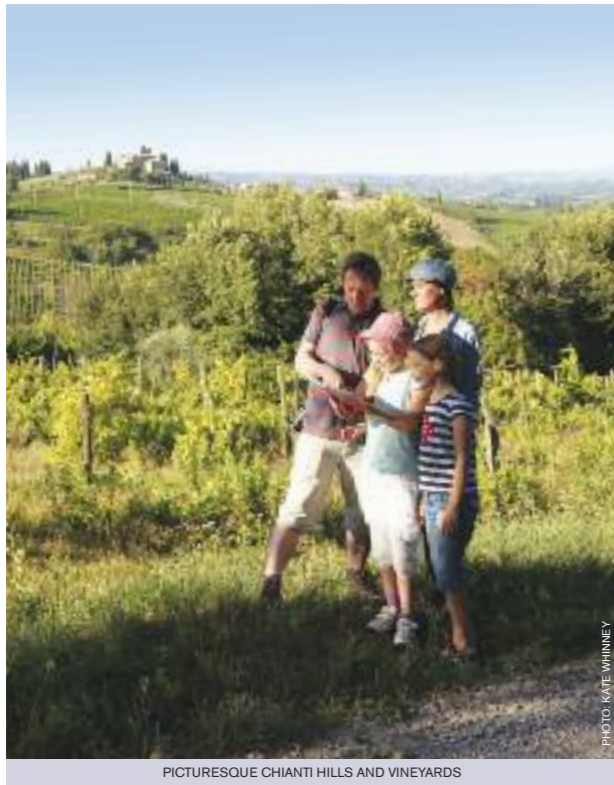
PICTURESQUE CHIANTI HILLS AND VINEYARDS