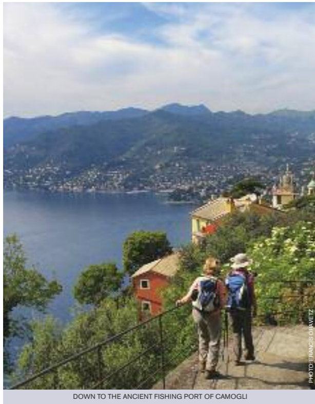
DOWN TO THE ANCIENT FISHING PORT OF CAMOGLI

Route Open • 16th Apr to 30th Jun; 1st Sep to 16th Oct