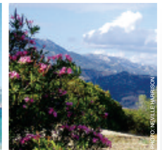
WILD AND BEAUTIFUL COUNTRYSIDE