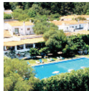
Hotel Su Gologone ★★★★