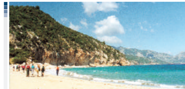
REMOTE SANDY COVES

Discover ancient paths, still used by shepherds, passing mysterious prehistoric stone towers, breathtaking gorges, magnificent cave systems and remote sandy coves only accessible on foot or by sea. This is some of the wildest and most unexpectedly beautiful countryside in Europe.