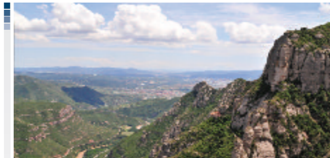
SPECTACULAR VIEWS WALKING THROUGH LIMESTONE SIERRAS

Discover limestone sierras intersected by spectacular gorges, where mountain rivers cascade from pool to pool and eagles and griffon vultures soar over flower-filled pastures, fine Romanesque churches and crumbling castles.