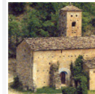
FINE ROMANESQUE CHURCHES