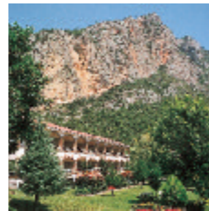
Can Boix ★★★★

For extension hotels in Barcelona see page 161