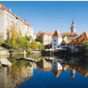
CESKY KRUMLOV - 'PRAGUE IN THE COUNTRY'