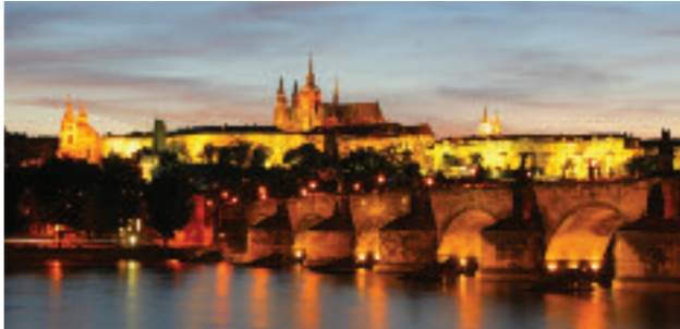
PRAGUE, WITH ITS CATHEDRAL SPIRES

Perfectly preserved Renaissance towns, so picturesque that they have the almost surreal quality of film sets. Telc, with its huge central square lined with harmoniously decorated façades and castle mirrored in one of the area's countless lakes; Slavonice, its houses decorated with 'sgraffiti'; Cesky Krumlov ('Prague in the country'), Renaissance and Medieval; and of course Prague itself.