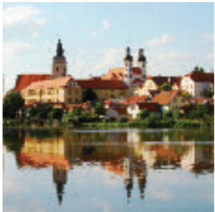
TELC CASTLE & LAKE