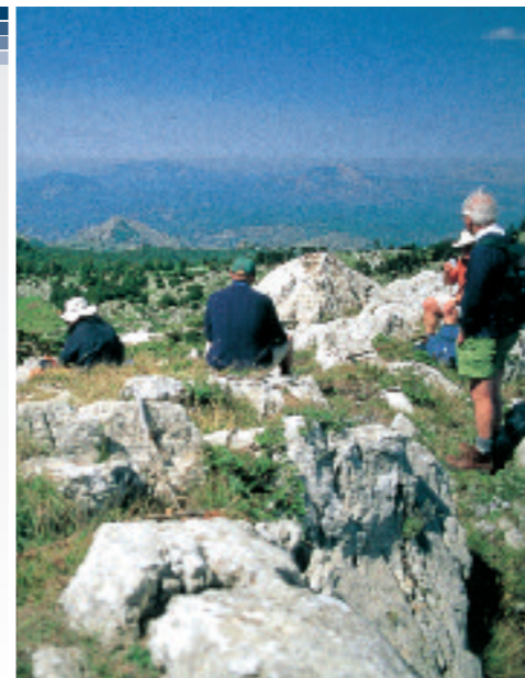
SPECTACULAR, HIGH MOUNTAIN MEADOWS

Discover one of Italy's least known and most outstanding and surprising areas – a great Baroque Cistercian monastery; a vast, 3,000-year-old hilltop citadel; an almost unvisited, superbly frescoed early rock church; spectacular high mountain meadows filled with flowers in spring; and delightful small medieval towns where we stay.