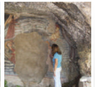
FRESKOED ROCK CHURCH OF SAN MICHELE