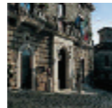
Villa Cosilinv ★★★★