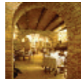
Il Castello di Altomonte ★★★★★

For extension hotels in Naples see page 160