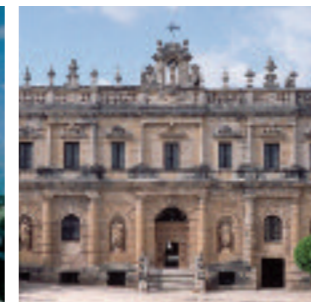
A GREAT BAROQUE CISTERCIAN MONASTERY