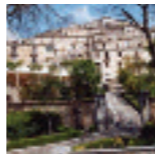
Villa San Domenico ★★★★