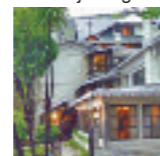
New Elgin ★★★