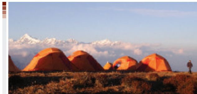
SUNRISE OVER KANGCHENJUNGA

This trip combines easy walking, much of it through high meadows in some of the most spectacular scenery in the Himalaya, with exploration of tea plantations and astonishing views across Nepal and to Bhutan, including five of the world's highest mountains and around fifty other major peaks. All this, and a range of diverse and colourful cultures, make this a truly outstanding trip.