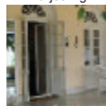
Glenburn Tea Estate Boutique Hotel